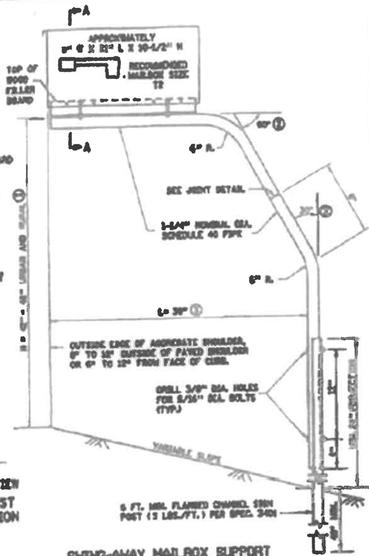
SWING-AWAY MAILBOX SUPPORT