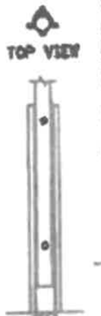
ROADWAY VIEW PIPE/POST CONNECTION